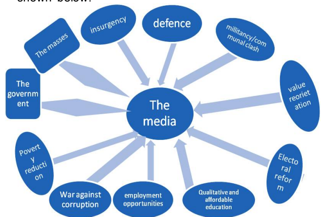
Figure 2: Safe Nigeria Model: Source: Gever 2016

In this segment, the researcher reviewed previous empirical studies that are related to the current one. First, the researcher reviewed a study conducted by Gever (2016) on 'Questioning the Safe School Initiative and Making a Case for a Safe Nigeria Model: The Media as the Nucleus'. The aim of the study was to find out the role of the media in the attainment of national security. The researcher adopted survey research design to achieve the study aim. Through a purposively sampling technique, 37 respondents were selected for the study. The result of the study showed that there cannot be safe schools in war-like zone. Findings further showed that Nigeria needs a comprehensive approach that addresses the myriad of challenges facing the country. These challenges were identified to cover the social welfare of Nigerian citizens to strengthening the public institutions to gain public trust. Based on the result of this study, Gever propounded a safe Nigeria model as shown below: